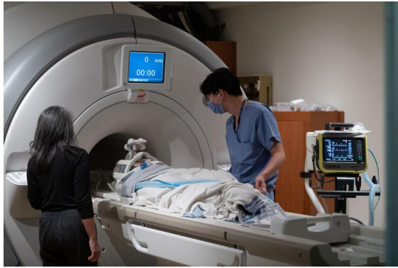
Clinical Trial Delivers Chemotherapy to Paediatric Brain Tumours Using MRI-Guided Focused Ultrasound