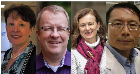
Temerty Medicine Scholars Awarded New or Renewed Canada Research Chairs