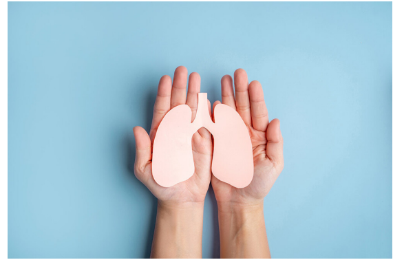
Working Across Disciplines, U of T and UHN Researchers Are Rapidly Revolutionizing Lung Transplant Surgery