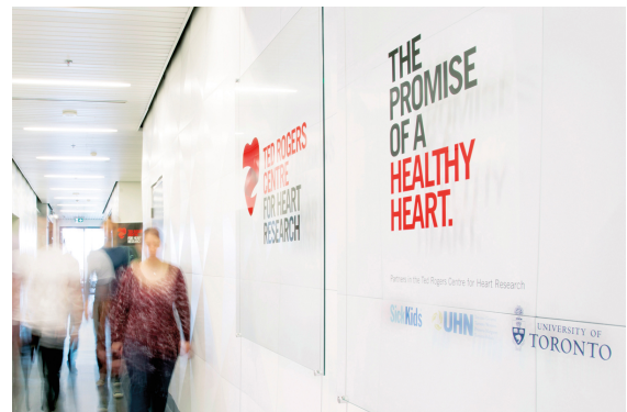
$90-million Gift to the Ted Rogers Centre for Heart Research Marks New Era in Cardiac Health