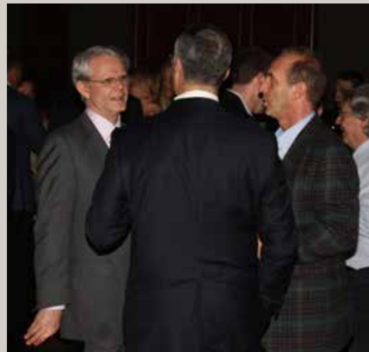
11 2011 Annual Holiday Party.