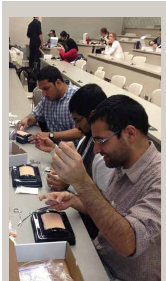
9 Suture Workshop for medical students