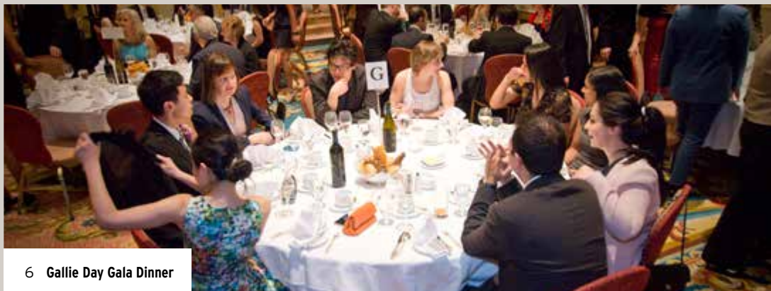
6 Gallie Day Gala Dinner