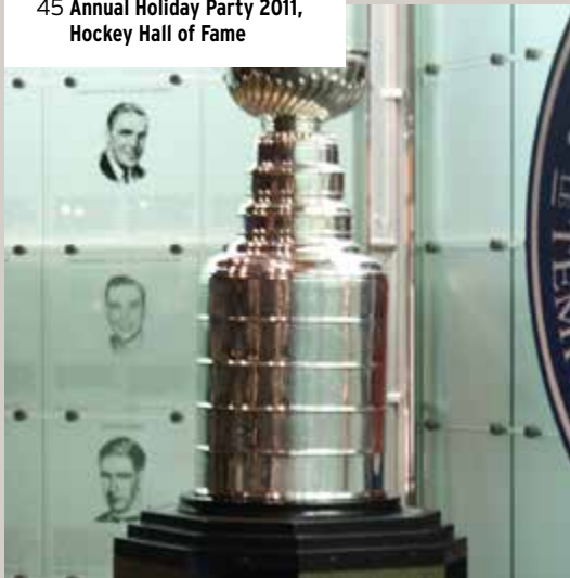
45 Annual Holiday Party 2011, Hockey Hall of Fame

Role of Group V and Group X secretory phospholipase A2 in the innate immune responses to pulmonary bacterial infection. Rubin BB: Canadian Institutes of Health Research. ($388,520 2009 - 2013).