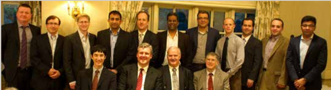
22 SpineFEST 2012 : The Old Mill Inn, June 15, 2012.