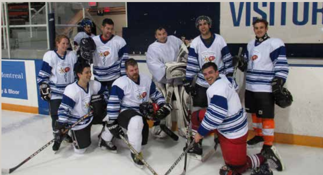
18 Plastic and Reconstructive Surgery Hockey Team