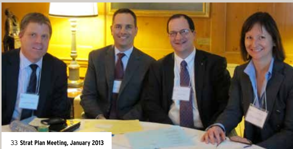
33 Strat Plan Meeting, January 2013