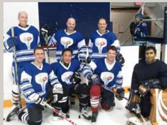
15 General Surgery Hockey Team

The success of the Trauma Program is but one example in an increasing number of ways the individual hospitals' surgeons are linked in a systematic way.