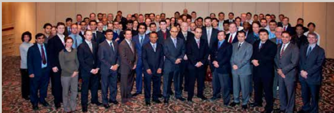
17 The Division of Orthopaedics Faculty

The University of Toronto's Division of Orthopaedic Surgery is continuing in its long history of excellence in clinical care, teaching, and research. Our faculty's renewed focus on innovation and integration has resulted in new education, research, and clinical advances. I am proud of how well our division members are working together to inventing the future of Toronto Orthopaedics.