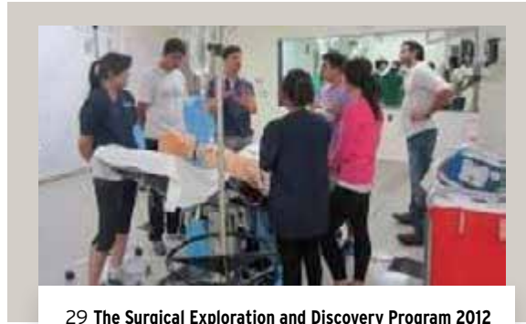
29 The Surgical Exploration and Discovery Program 2012

Of 39 surgeons, 25 have funded research programs. The department is engaged in a wide variety of clinical and basic research supervising 19 research fellows, 16 Masters and 17 PhD students.