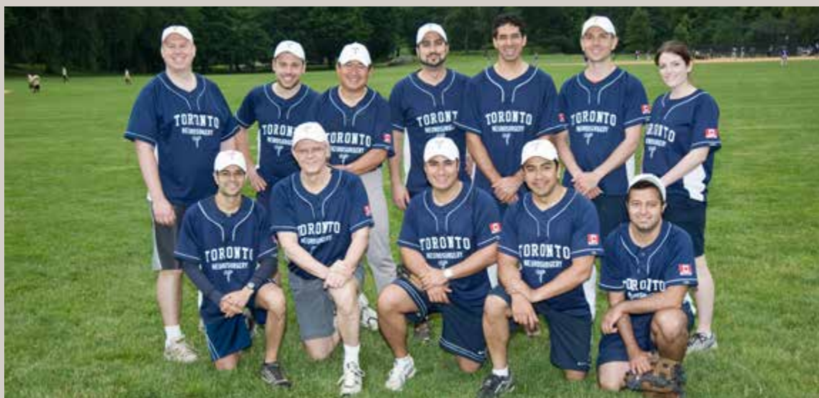
16 9th Annual Neurosurgery Charity Softball Tournament, June 9, 2012, Central Park, N.Y.